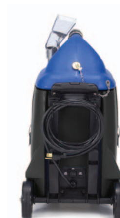
Sturdy aluminum telescoping handle for transport.