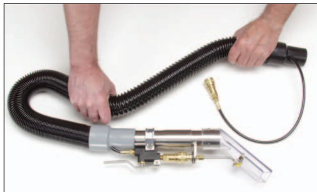
Stretch 2.5' to 10' insider vacuum and solution hose.

Powr-Flite COMMERCIAL FLOOR CARE EQUIPMENT