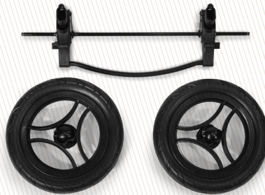
Rear Wheels and Axle