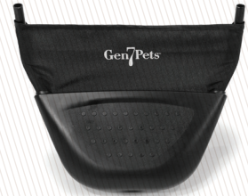
Front Wheel Assembly